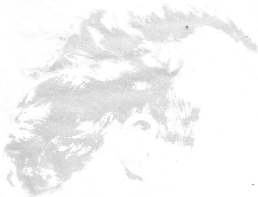
Max Neuhaus image, Hear Paper, 1976 Collection MNE

210 FIFTH AVENUE NEW YORK NY 10010 TELEPHONE 212 683-9222